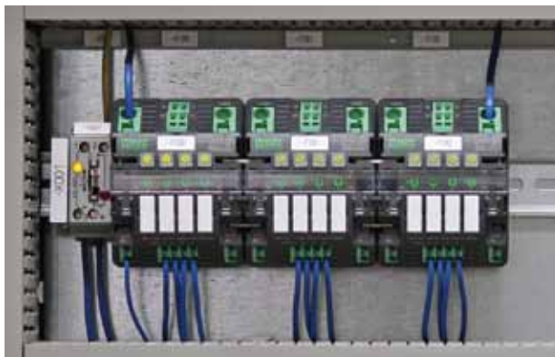
Efficient circuit protection with MICO

MVK Metal's single channel diagnostic is another important feature for KUKA's engineers. LEDs indicate the modules' connection and supply state. In the event of an error, only the affected channels are shut off keeping some operations running while reducing downtime.